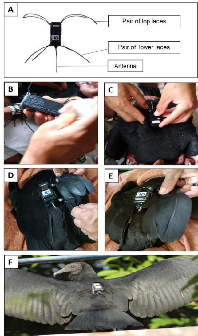
Fig. 1. (A) A transmitter ready for attachment to Black Vulture, ( Coragyps atratus ), (B) application of the ethyl cyanoacrylate glue to the adhesive tape attached to the underside of the transmitter, (C) application of manual pressure to the transmitter to ensure the adhesion of the glue to the back feathers of the vulture (D) isolation of the tertiary cover feathers for the attachment of the top laces, (E) isolation of the tertiary feathers for the attachment of the lower laces, and (F) the transmitter in place prior to release.

the base of the cover feathers in the region of the scapula (Fig. 1D), and the lower laces, to the base of one or two of the tertiary feathers of the wings (Fig. 1E), which were closest to the body. Every effort was made to ensure that the plumage was arranged as naturally as possible, to ensure the fixation of the transmitter without causing the animal any discomfort. The tertiary feathers were chosen to fix the transmitters because these feathers protect the primaries and secondaries, either fully or partially, and are not considered to be flight feathers (Ferguson-Lees and Christie 2001).